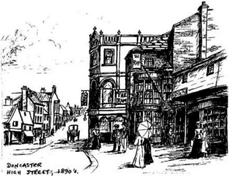
DONCASTER HIGH STREET, 1890's.